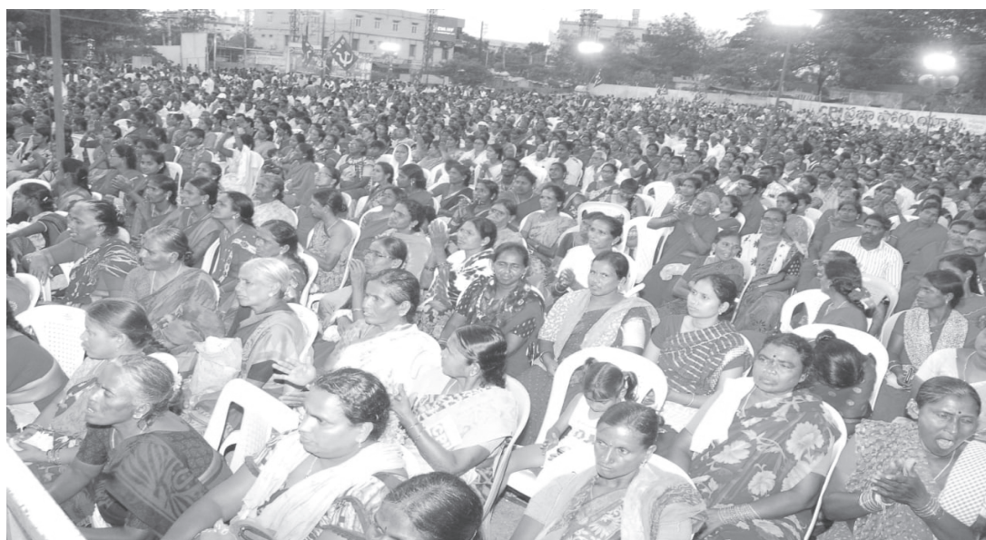
A view of the gathering

"BJP Hatao-Desh Bachao" in order to dethrone BJP from power.