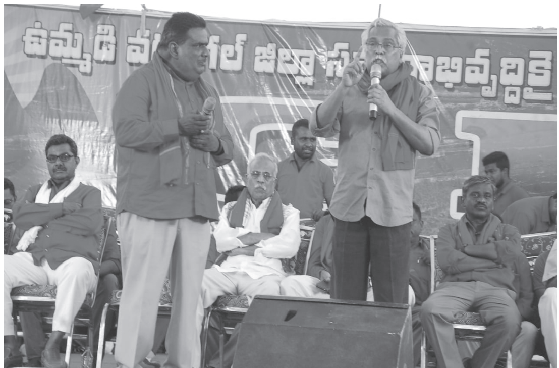
CPI national council secretary Binoy Viswam MP addressing the public meeting

busy in polarising them on communal lines like religion and caste etc. Though India got independence seven decades back but basic problems of people like food and shelter remain unresolved. That is why CPI is fighting on behalf of people in general and poor in particular. Left, secular and democratic forces should launch united struggles against corrupt ruling party BJP. If all these forces are united, it is sure to send these present rulers back home back. CPI national council is fighting with a slogan of "Modi Hatao-Desh Bachao". In old Warangal district CPI is launching historic struggles for house sites