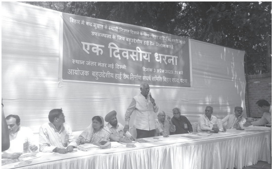
CPI general secretary D Raja addressing the dharna