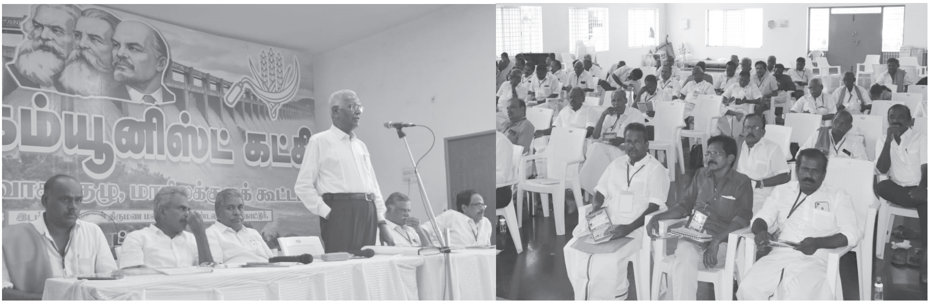
CPI general secretary D Raja addressing the meeting

The meeting of the Tamil Nadu State Council of the Communist Party of India was held in Salem from August 14 to 17. General Secretary of the party D. Raja guided the meeting and met the press also.